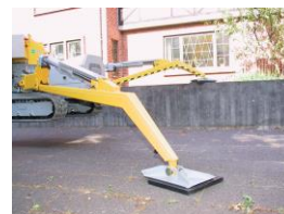
Easy set up